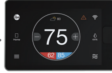
EcoNet Smart Thermostat